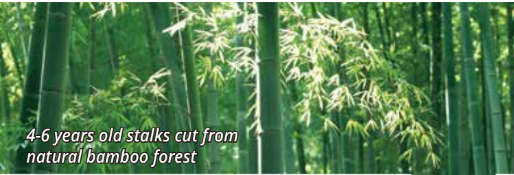
4-6 years old stalks cut from natural bamboo forest