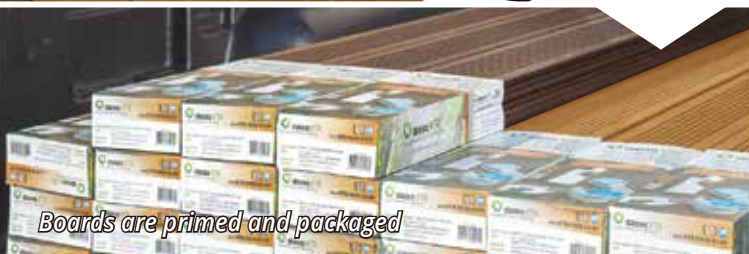
Boards are primed and packaged