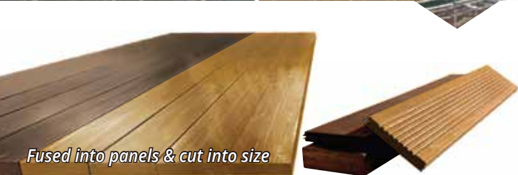
Fused into panels & cut into size