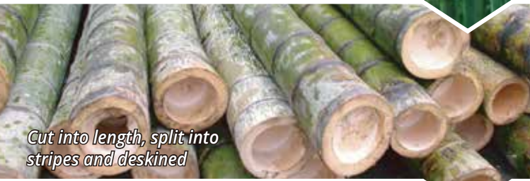
Cut into length, split into stripes and deskins